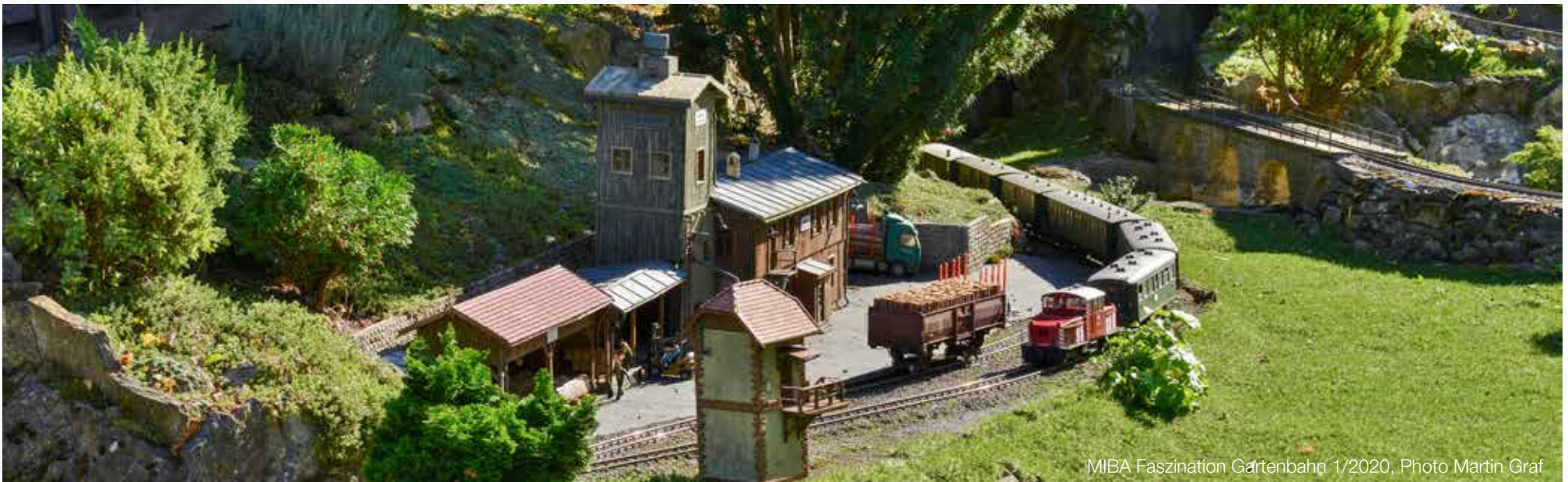
MIBA Faszination Gartenbahn 1/2020