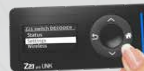
Direct configuration with buttons and display