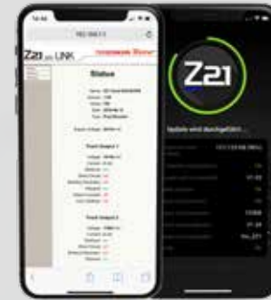
With mobile device